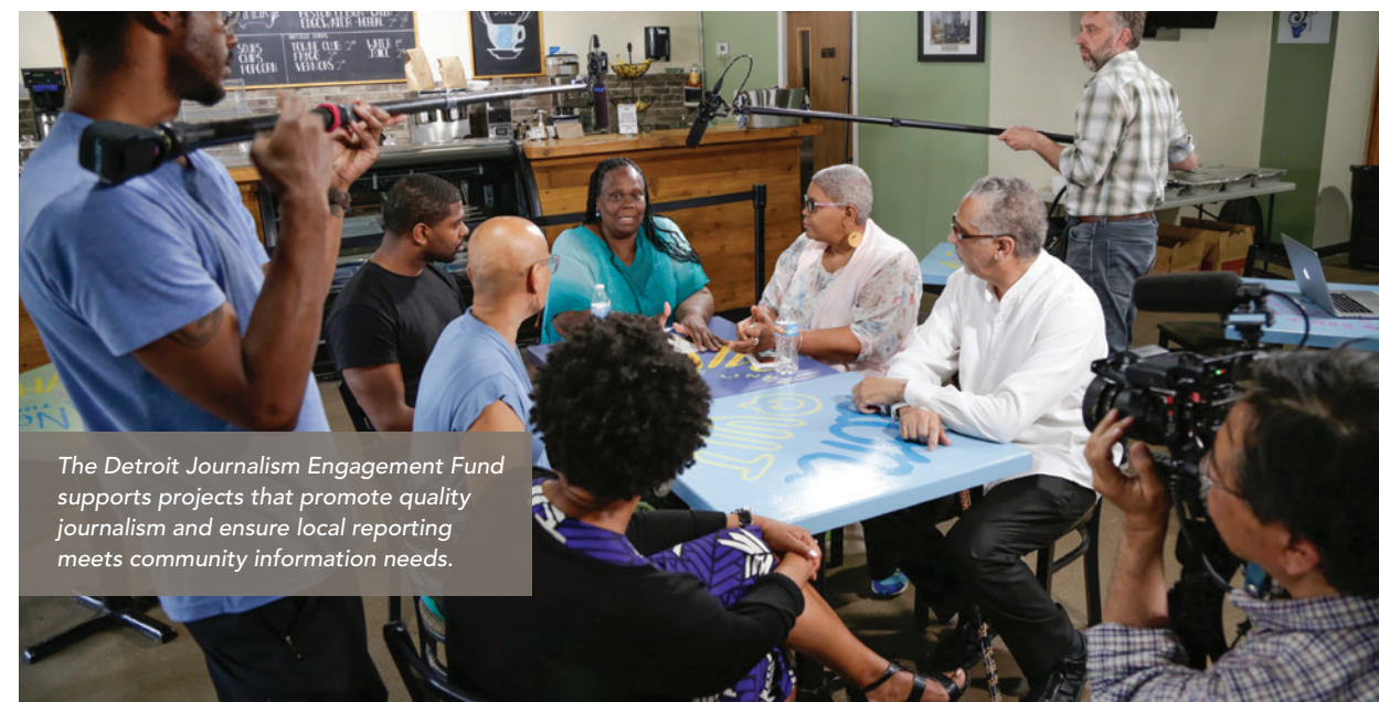
The Detroit Journalism Engagement Fund supports projects that promote quality journalism and ensure local reporting meets community information needs.

For more information, visit CFSEM.org/journalism .