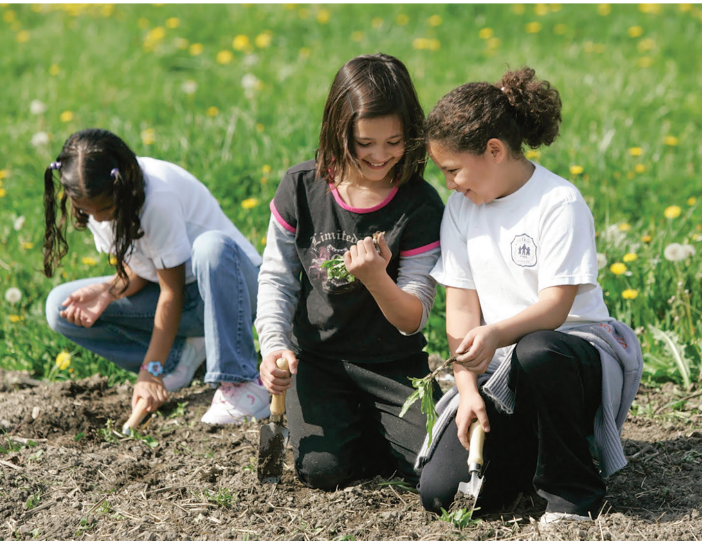
Studies show exposure to nature can counteract depression, improve self-esteem, creativity, and lower child obesity.

region's seven counties. Parks promote healthy lifestyles, decrease crime, and increase interactions — all leading to more vibrant, healthy communities. Access to outdoor spaces and trails is also key to addressing medical conditions such as obesity, diabetes, and heart disease.