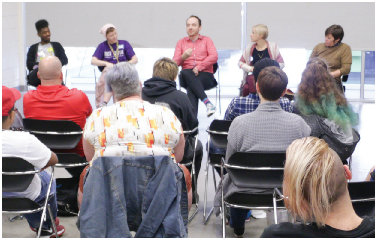
LGBT youth were able to participate in a digital storytelling project with The Neutral Zone in Ann Arbor.

For lesbian, gay, bisexual, and transgender (LGBT) teens, acceptance can be challenging. A sense of community is critical to their well-being. A recent Community Foundation HOPE Fund grant to The Neutral Zone in Ann Arbor supported an opportunity for LGBT youth to tell and share their stories. Established in 1994, The HOPE Fund was created to strengthen organizations and projects that support LGBT individuals and families in southeast Michigan.