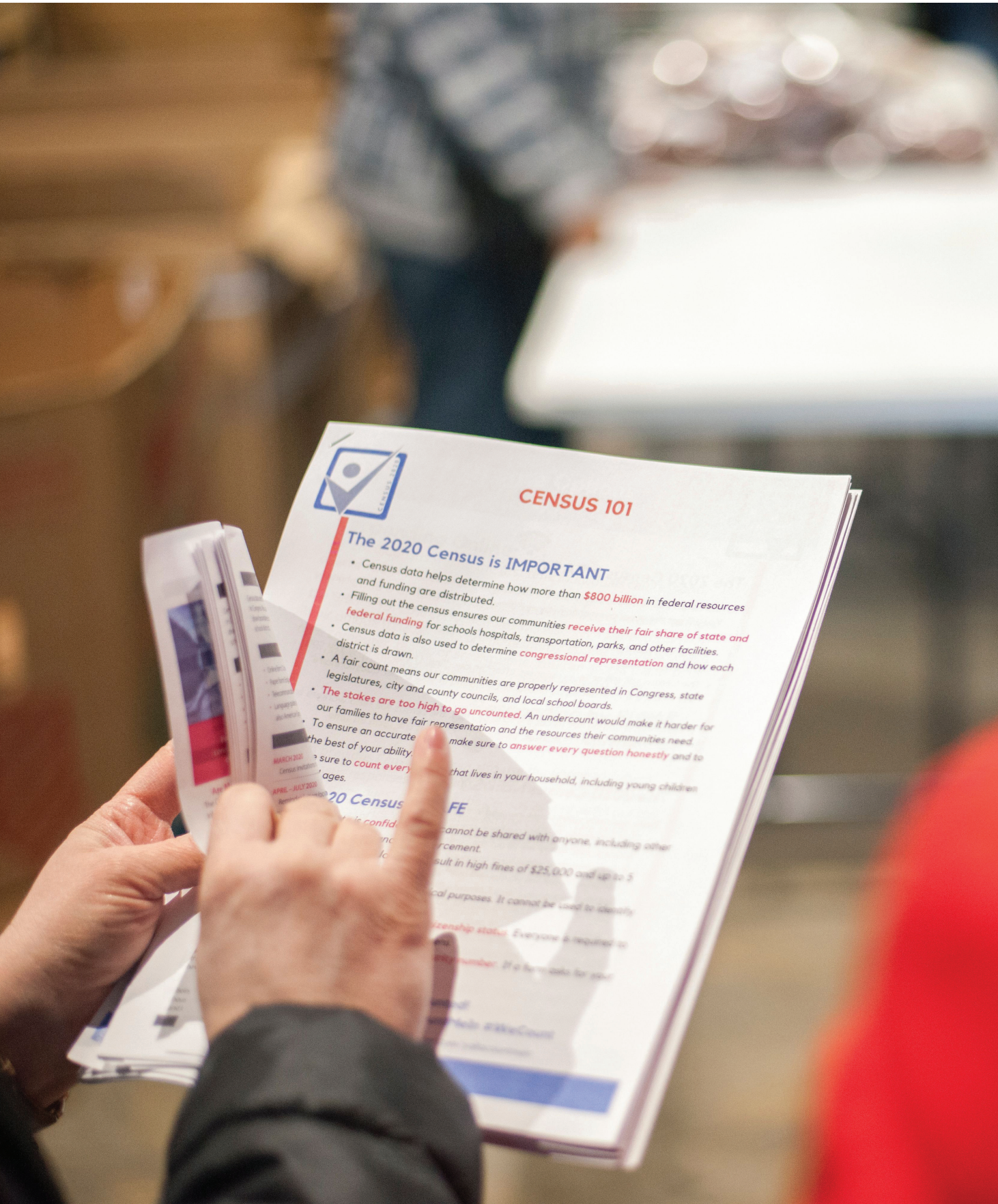
In 2019, the Community Foundation distributed nearly $1 million in grants to organizations seeking to promote and support a fair and accurate count in the 2020 United States Census.

As we move toward a more globalized society, it is imperative that we continue to create safe, healthy, and informed places for residents from around the world to live, work, and play.