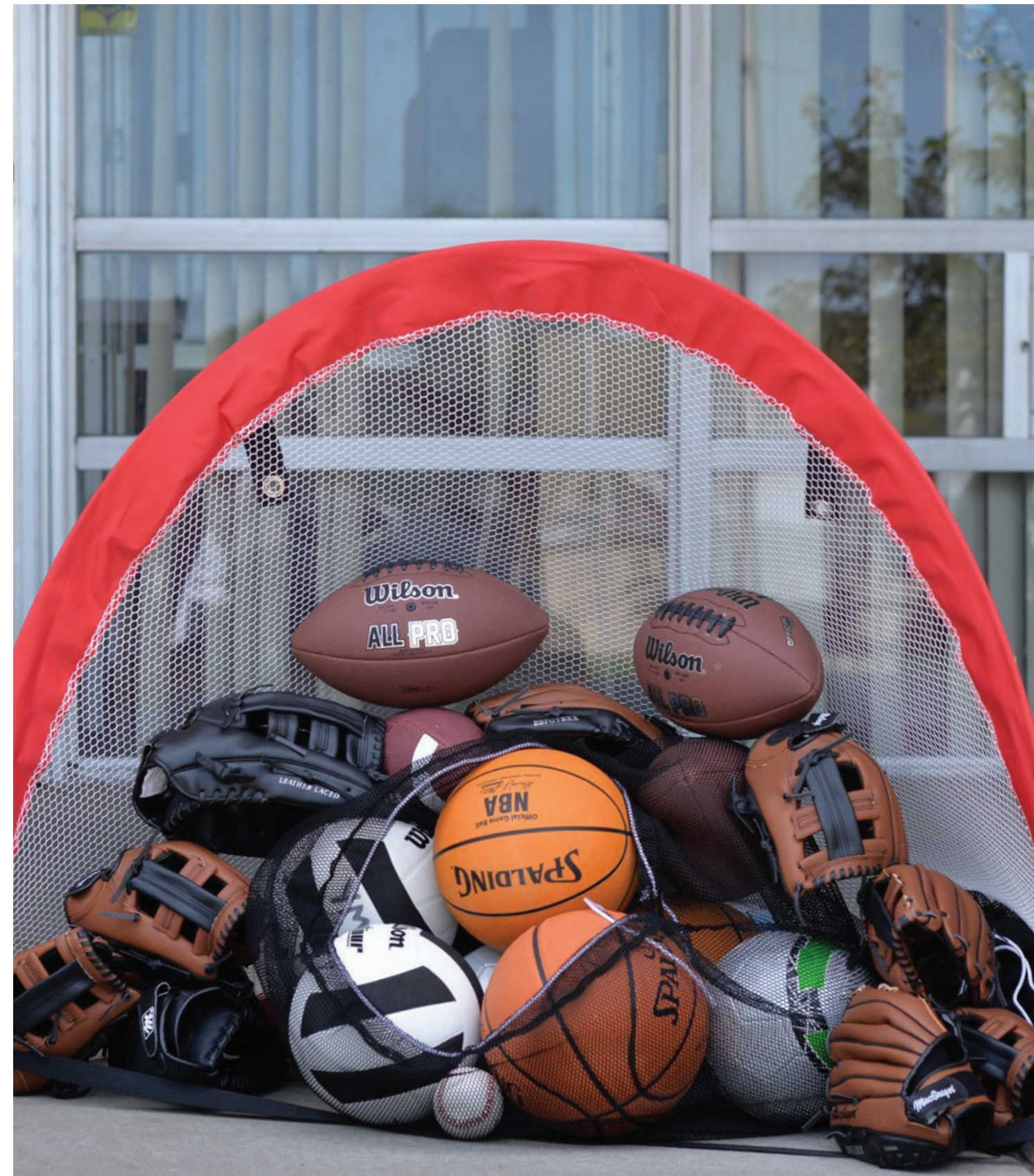
To encourage more active lifestyles among youth, visitors to 15 SportPort sites across the region – including this one at the Pontiac Public Library – can check out a variety of sports equipment from footballs, basketballs, and soccer balls, to hula hoops, kites, fishing poles, and more.

As we continue to look for ways to innovate as a local philanthropic group, we look forward to working with new donors, funders, and nonprofits eager to make an impact in children's lives.