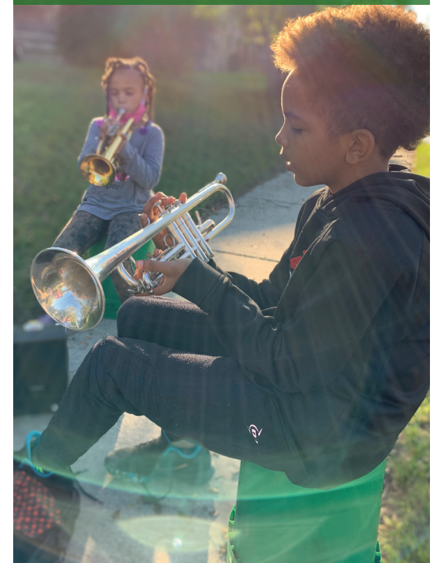
Students of the Accent Pontiac porch lessons program practicing music while social distancing in summer 2020.

Findings from the study showed that, at the time of the assessment, more than 35 percent of the