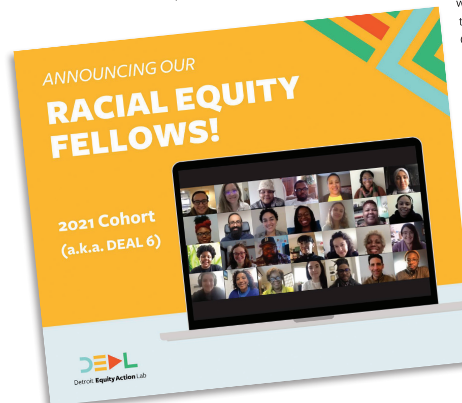
In February, the Detroit Equity Action Lab announced the 2021 cohort of its racial equity fellowship program, now in its sixth iteration.

will lift the voices of journalists from the Red Cliff Band of Lake Superior Ojibwe, the Grand Traverse Bay Area Ojibwe, and the Sault Tribe of Chippewa Indians in northern Michigan. Their stories will be shared in the Traverse City Record-Eagle , and in one of the many media outlets in southeast Michigan.