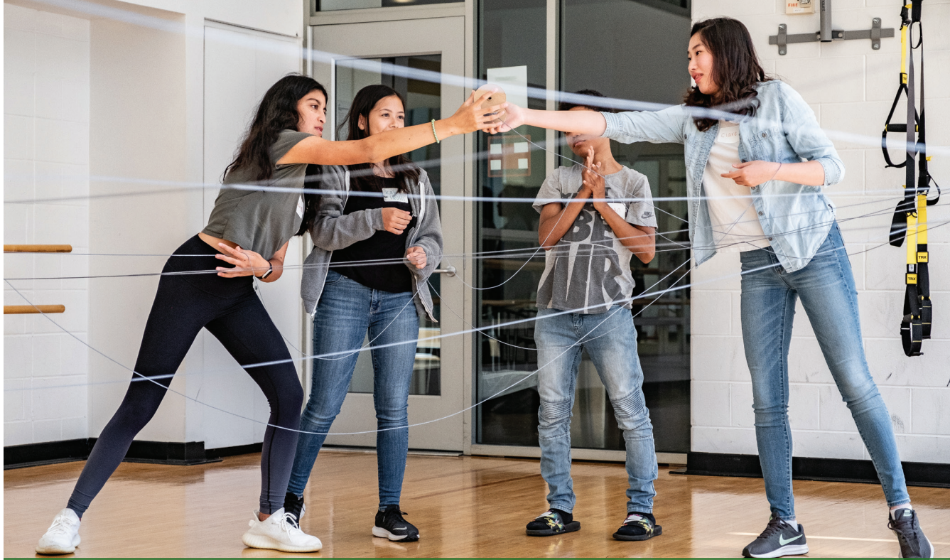
YAC members participate in a team-building exercise during a kickoff event for the 2019-2020 cohort. The YAC offers a unique opportunity to learn about philanthropy, grantmaking, and volunteerism, while also providing a place to help youth develop and strengthen their leadership skills.