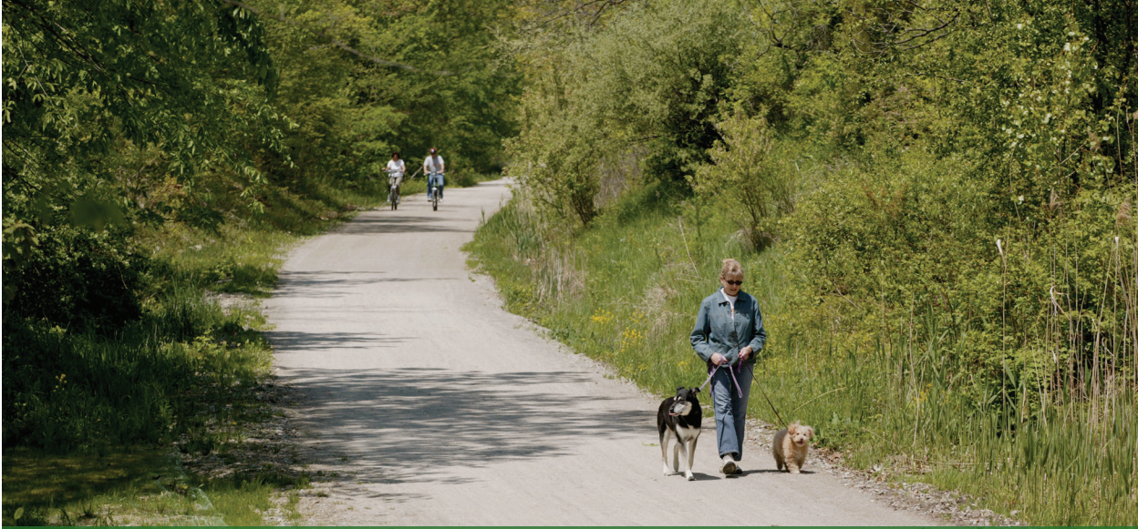
The Community Foundation and the Pontiac Funders Collaborative recently issued a grant to Friends of the Clinton River Trail for a trail maintenance project that will design, engineer, and construct significant enhancements to the Clinton River Trail in Pontiac.