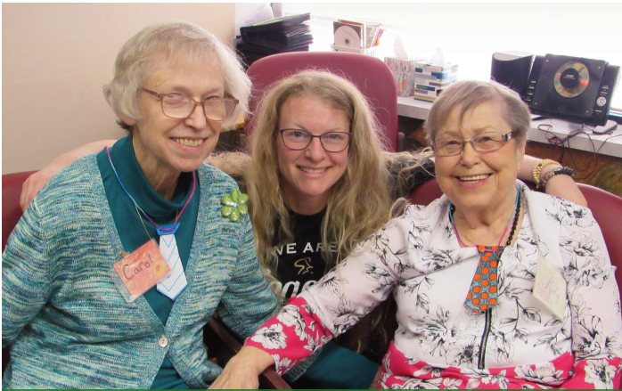
Senior services at Livingston County Catholic Charities include art therapy, cooking groups, chair exercises, and other enrichment activities provided by caregivers.

Through the Ralph C. Wilson, Jr. Legacy Fund for Caregivers, the Community Foundation awarded grants to 19 organizations supporting caregivers in the region. Grants also went to groups working to meet other needs for older adults and to promote increased senior care. Grants were made to address the impacts of COVID-19 and provide flexibility to organizations ranging from neighborhood-based groups to hospice care centers to those supporting caregivers of individuals with Alzheimer’s disease.