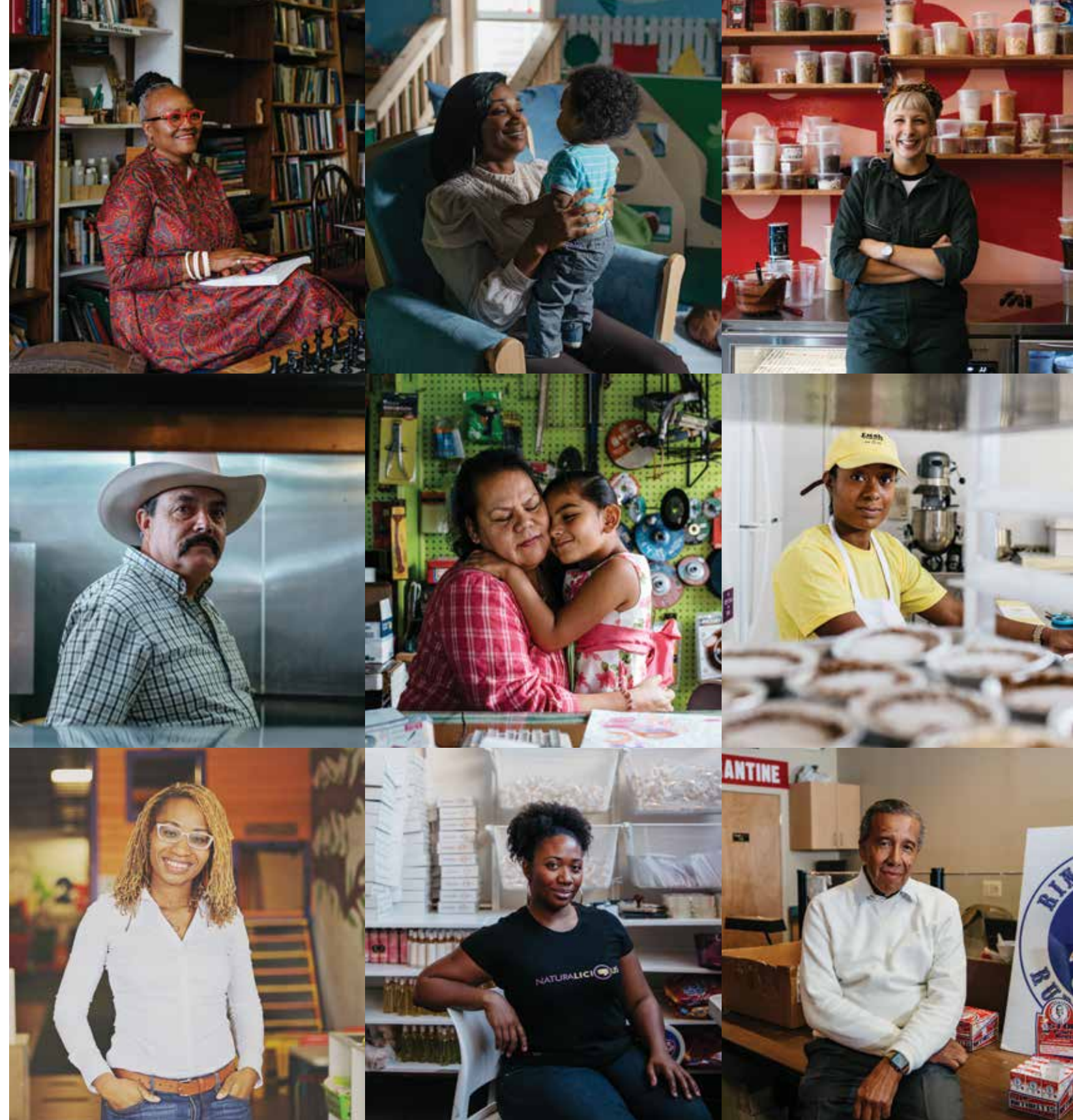
Local small businesses gained access to stabilization funds, practical assistance, and personal protective equipment in 2020 through the Community Foundation for Southeast Michigan's New Economy Initiative.

Community Foundation for Southeast Michigan, Fifth Third Bank, Ford Foundation, Hudson-Webber Foundation, JPMorgan Chase, John S. and James L. Knight Foundation, Ralph C. Wilson Jr. Foundation, William Davidson Foundation